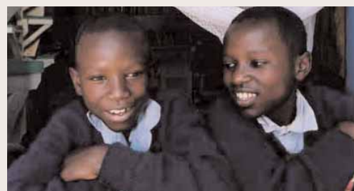
Fees have been abolished in Kenya and an extra one million children are now in school

Isn't it time that poor countries had the chance to share the dignity that comes with learning? For all these reasons, education is a key part of ActionAid International's work, and that is how it will stay.