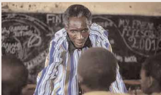
In Africa, education is far from free

education universally available. And then pressure on international bodies to help ease that task by living up to their regularly-made promises. For it is often an economic issue. In Africa, education is far from free. There will be school fees and there will be the other costs – the books, the materials, the equipment.