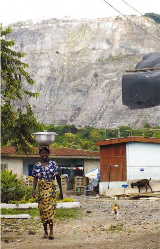
Open cast gold mining looms over Anyinam village