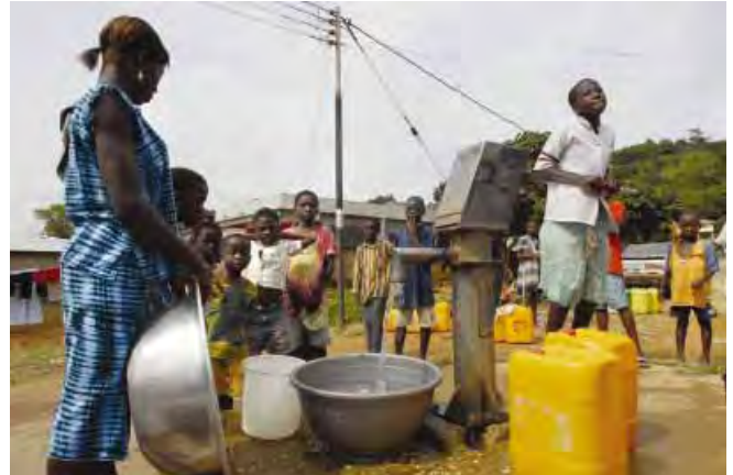
Local water supplies have been tested for contamination in Obuasi

Research carried out for TWN Africa between 2002 and 2004 indicates dangerously high levels of water contamination in the Obuasi area. "Historic mining and more recent extensive surface mining operations have combined to damage the quality of water, especially surface water in the study area. The waters in the study area are acidic, falling outside the EPA [Environmental Protection Agency] and WHO range of standards...The presence of heavy metals such as iron, arsenic and manganese is particularly high in most streams sampled... Arsenic values were between 10 to 38 times higher than levels permitted by EPA general guidelines and over 1,800 times higher than the WHO maximum values. The same pattern was observed for manganese, whose values were up to 26 times higher than EPA-allowed limits. Iron values were between 1.7 and 15 times higher than levels allowed by EPA guidelines." 4