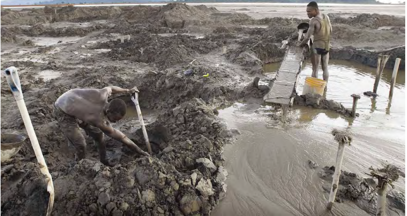
Illegal small-scale goldminers – known as 'galamsey' – pan for gold ore at Dokyiwa tailing dam