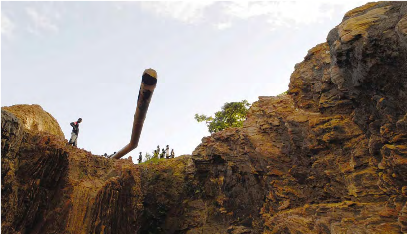
Several abandoned mining pits - such as this one in Binsere - pose hazards to local people

Farmer Ernie Poku from Binsere said the impact of the abandoned pit on his livelihood was profound. “We no longer have access to our farmlands as a result of the pit,” he said. The pit was initially dug to search for gold deposits, after which it was used as a waste dump. An old rusted pipe, previously used to transport the waste, dips into the pit.