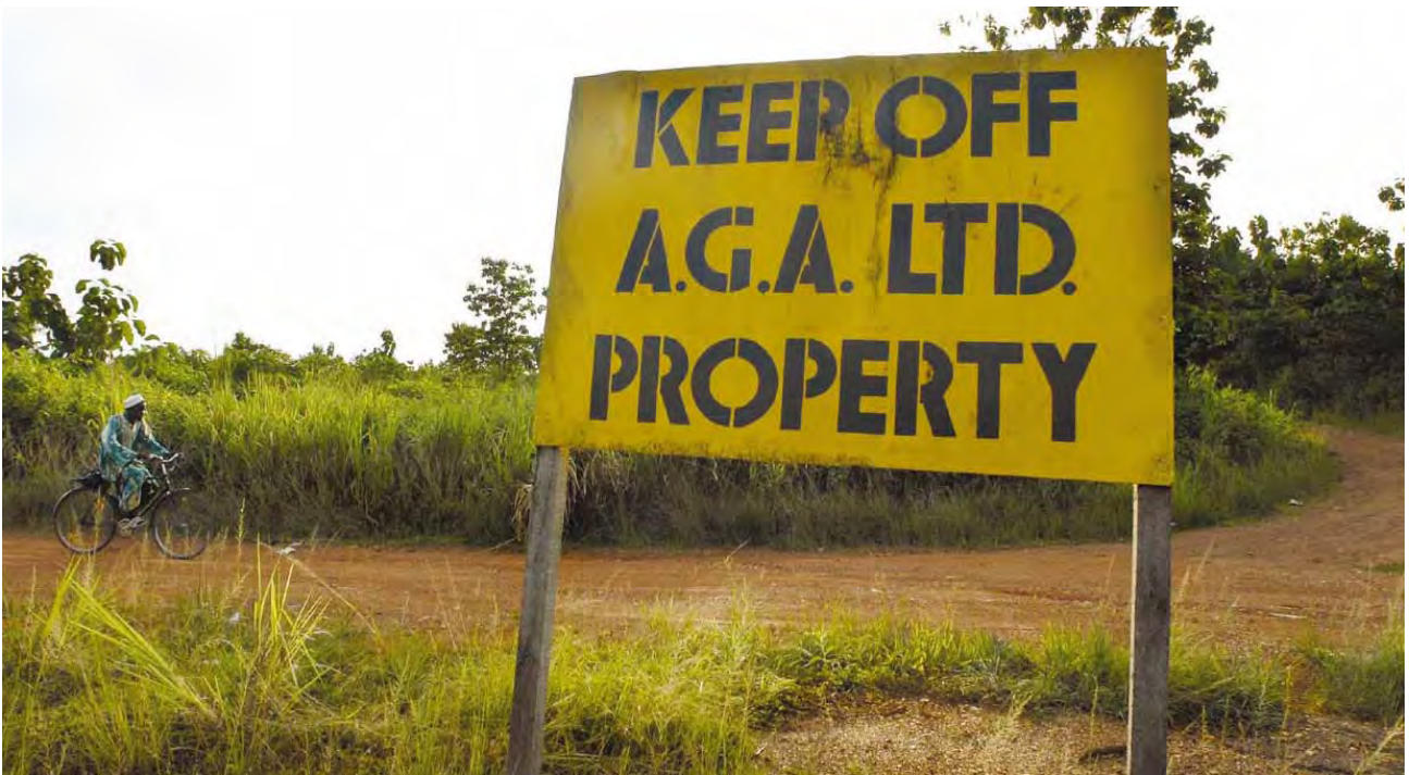
AngloGold has sprayed 90,000 homes with insecticide to tackle rampant malaria in Obuasi

“As regards the allegations of skin and respiratory diseases AngloGold Ashanti is ready and willing to cooperate with any such investigations into these concerns and undertaking mitigative [sic] or corrective actions should there be any linkages established with our operations.” 23